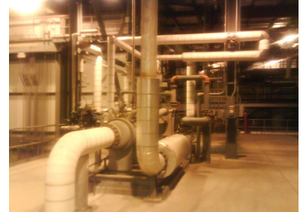
Attemporator spray block bi-directional valves operating maintenance-free for over five years

Absolute zero-leakage. ValvTechnologies tests every valve according to ANSI procedures, however, we toughen the standard and define zero-leakage as no detectable leakage of gas or a liquid for a period of three minutes or greater. The ValvTechnologies' standard is zero drops and zero bubbles, guaranteed.