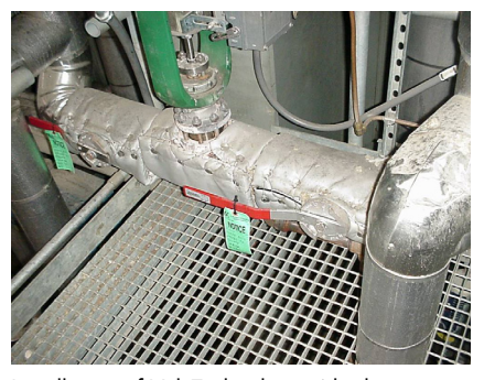
Installation of ValvTechnologies' high-pressure bi-directional valve