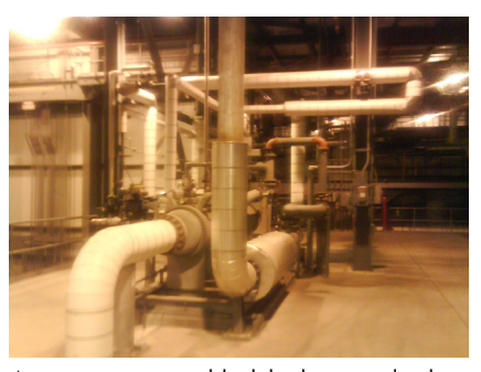
Attemperator spray block bi-directional valves operating maintenance-free for over five years