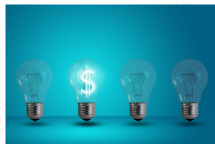
Reduced megawatt output