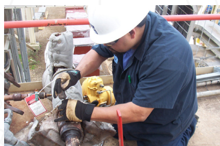
Maintenance and repair costs